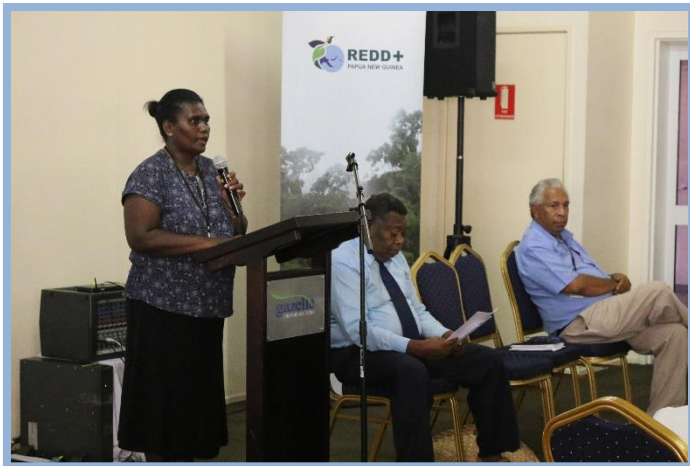
REDD+ Sub-national Development