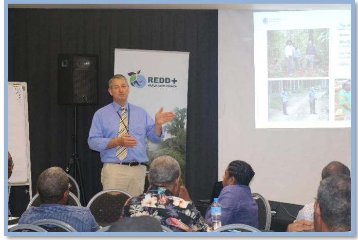
Forestry future scenario with PS engagement