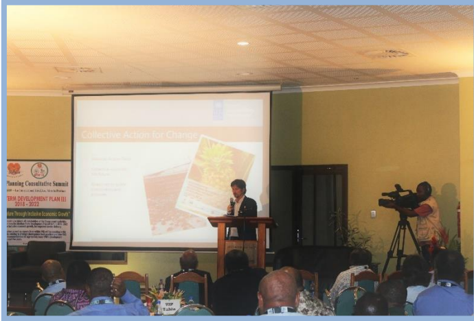
PNG National Development Summit