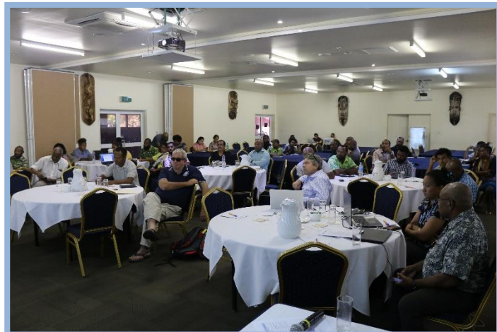
REDD+ Capacity Building and Consultation Workshop