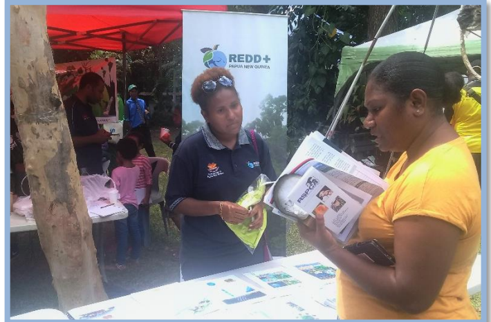
REDD+ Awareness on the World Environment Day